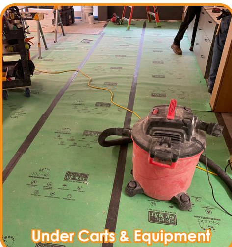
Under Carts & Equipment