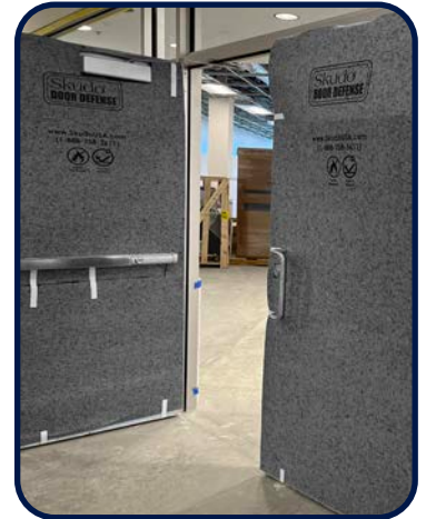
Adjusts to Fit Most Standard-Sized Doors

Fits Door Sizes: 42" x 84" | 42" x 96" | 44" x 84" | 44" x 96" 48" x 84" | 48" x 96"