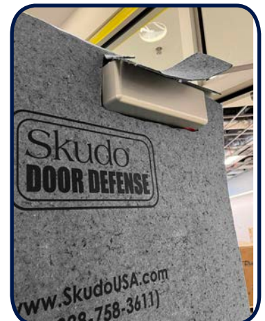
Stays Securely in Place

Innovative, purpose-built surface protection systems. This is all we do.