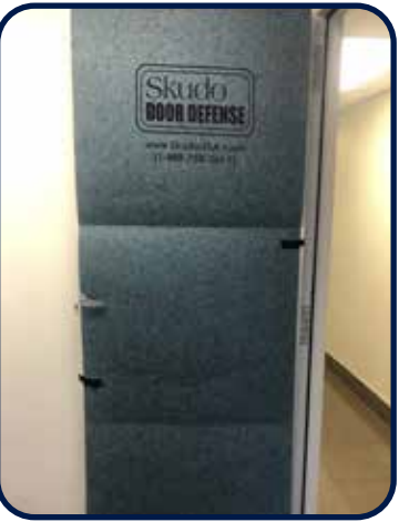
Fits Standard-Sized Doors