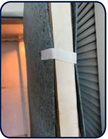
Stays Securely in Place