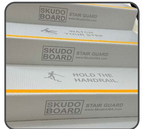
Slip-resistant for safety