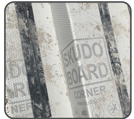
Extremely high impact resistance