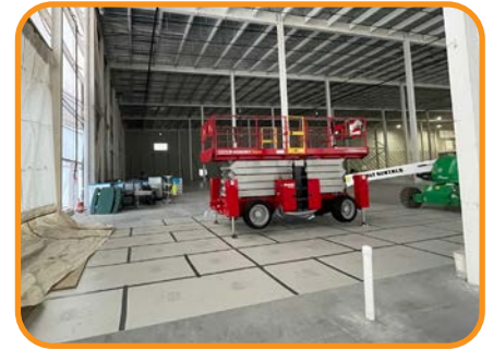
High impact protection