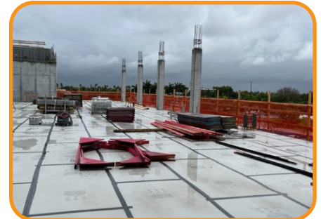
Water resistant, resists curling and warping