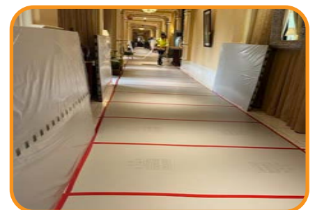
Fabric Back version available for additional protection

Innovative, purpose-built surface protection systems. This is all we do.