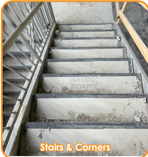
Stairs & Corners