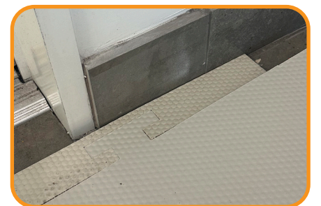
Edge pieces fill in gaps along walls

Innovative, purpose-built surface protection systems. This is all we do.