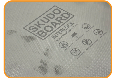
Extremely high impact resistance