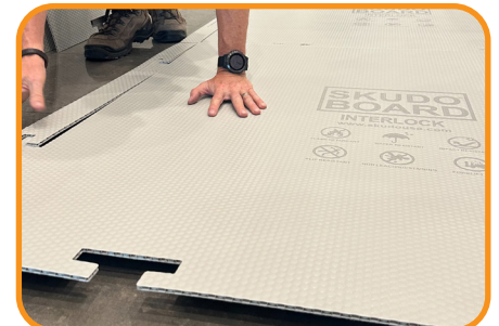
Interlocking tabs hold product securely in place