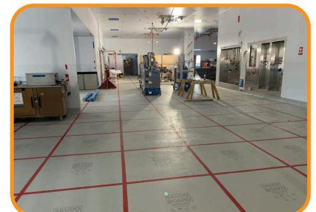
Superior protection under forklift and construction traffic