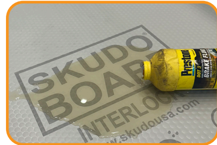
Fire retardant, fluid & slip resistant