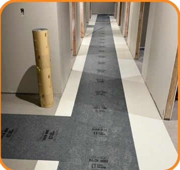
For Any Project Size

*Please see "Limitations" section (flip side)