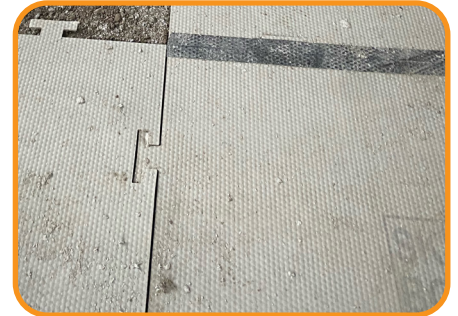
Extremely high impact resistance