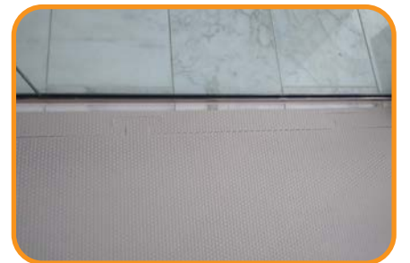
Edge pieces fill in gaps along walls

Innovative, purpose-built surface protection systems. This is all we do.