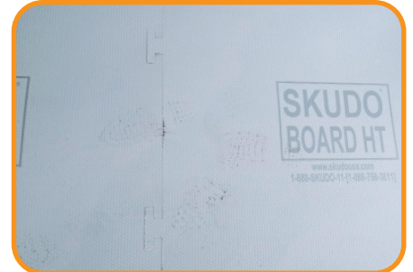
Interlocking tabs hold product securely in place