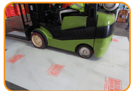
Superior protection under forklift and construction traffic