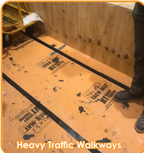
Heavy Traffic Walkways