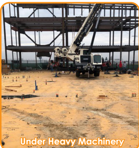
Under Heavy Machinery