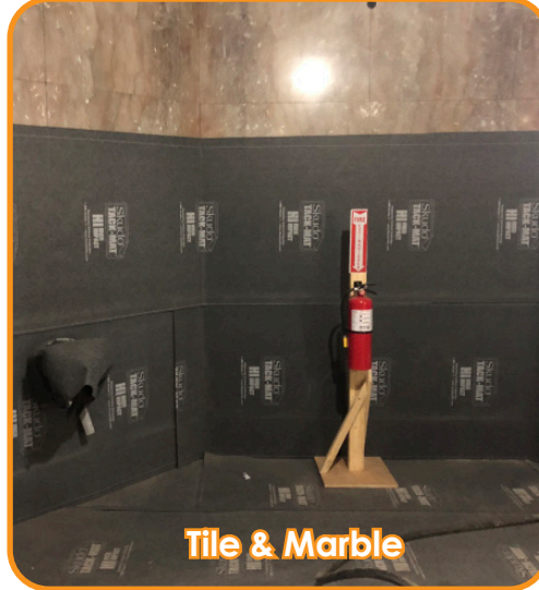
Tile & Marble