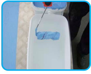
6. After application, rollers and any other equipment should be washed thoroughly in cold water.

5. Let dry in a rain free environment. Glass Advanced will gain maximum strength after 3 days