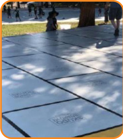
Use SkudoBoard over HT Commercial areas with high traffic, heavy machinery