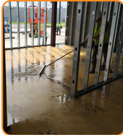
Sweep or squeegee standing water off the HT Commercial System