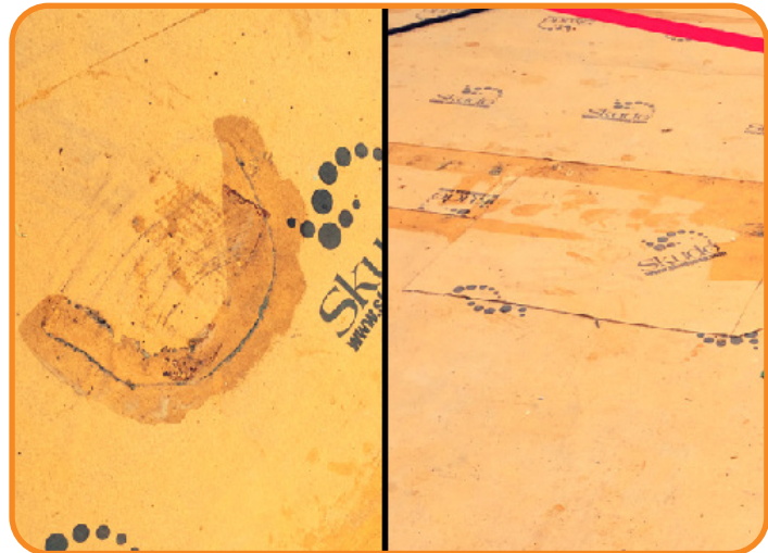
Inspect daily for tears and patch/repair if needed

Innovative, purpose-built surface protection systems. This is all we do.