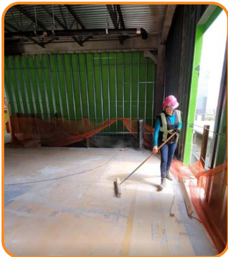
Sweep to keep clean