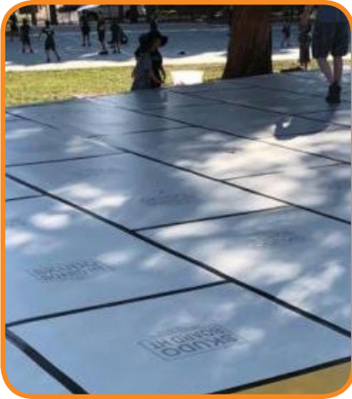
Use SkudoBoard over HT Commercial areas with high traffic, heavy machinery