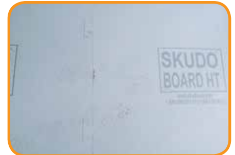
Interlocking tabs hold product securely in place