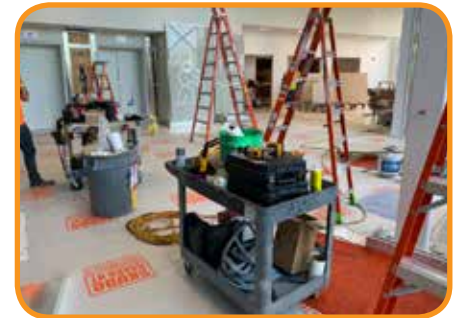
Extremely high impact resistance