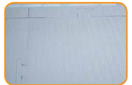
Edge pieces fill in gaps along walls

Innovative, purpose-built surface protection systems. This is all we do.