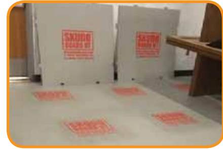
Fire retardant, water & slip resistant