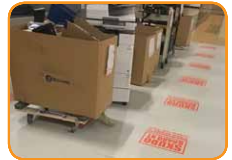
Extremely high impact resistance