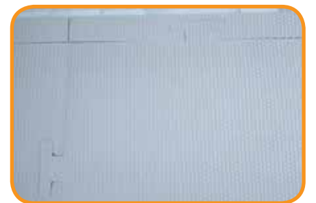
Edge pieces fill in gaps along walls

Innovative, purpose-built surface protection systems. This is all we do.