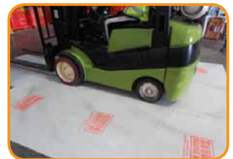
Superior protection under forklift and construction traffic