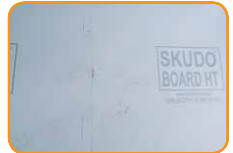
Interlocking tabs hold product securely in place