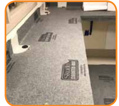
Sized for countertops