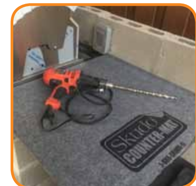
Protection from equipment

Innovative, purpose-built surface protection systems. This is all we do.