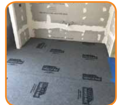
Perfect for small areas