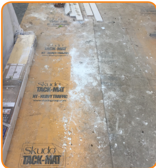
Heavy Traffic Walkways