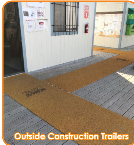
Outside Construction Trailers