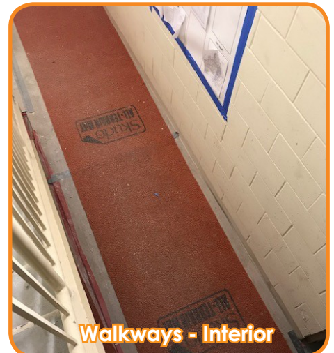
Walkways - Interior

Innovative, purpose-built surface protection systems. This is all we do.