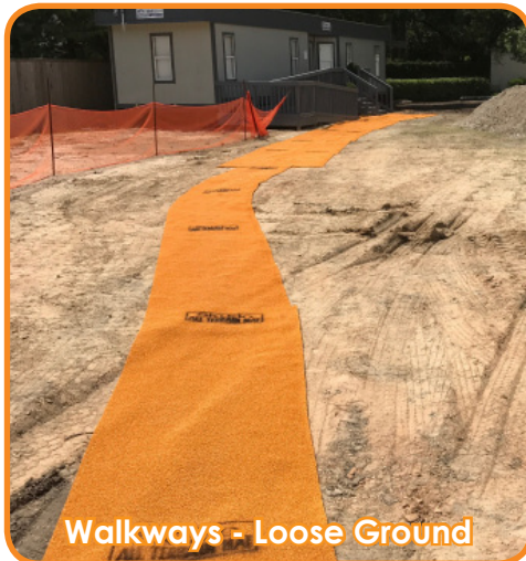
Walkways - Loose Ground