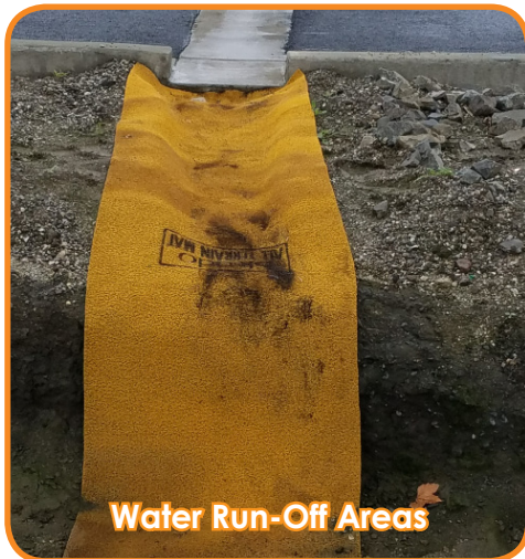
Water Run-Off Areas