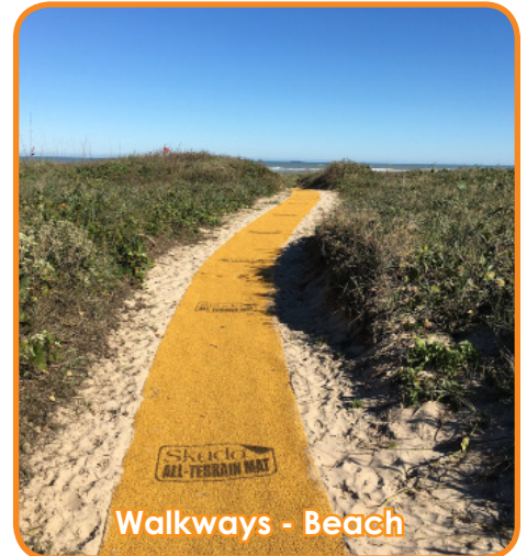
Walkways - Beach