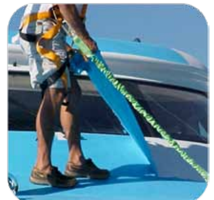
Peel Up Removal