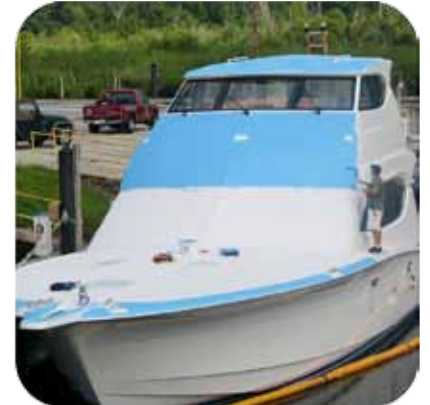
Protects During Storage