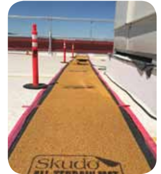
Safely Direct Traffic through a Jobsite - including TPO Roofs