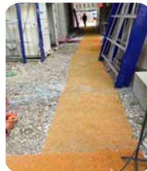
Stays in Place Over Harsh Terrain