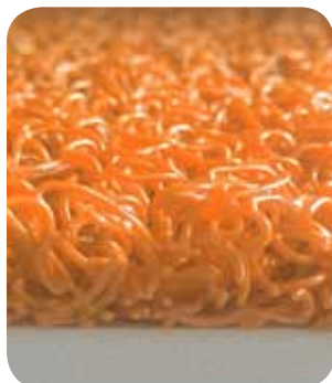
Thick, Heavy Duty Surface