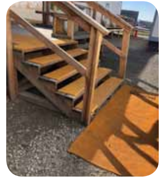
Traps Dirt & Debris

For jobsites with rough terrain, heavy rain, mud, snow and ice, Skudo's All-Terrain Mat is the solution.