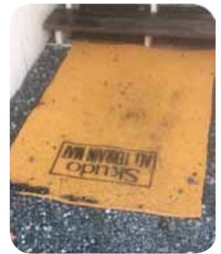
Use over Mud & Rocks