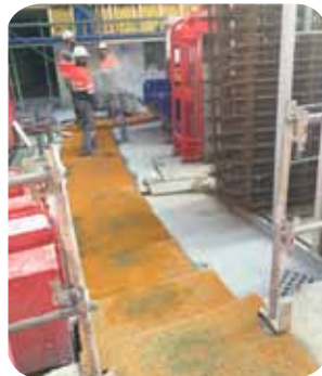
Perfect for Workers, Contractors, & Clients