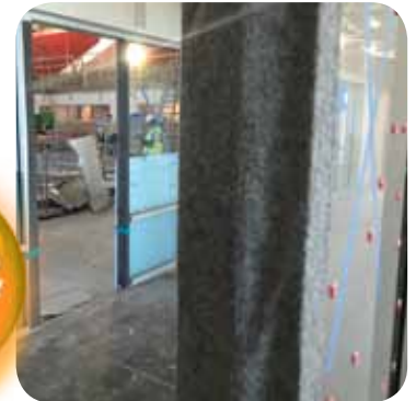
Peel up and re-apply