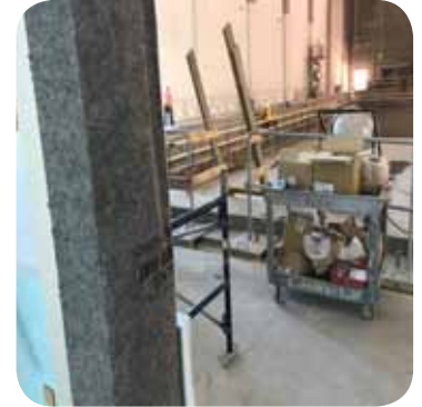
Perfect for framing

*Please see "Limitations" section (pg 2)