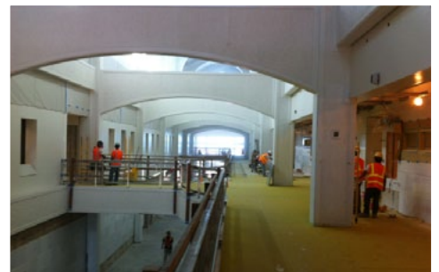
Third floor main traffic areas protected during construction

Skudo's Commercial System, MT (Medium Traffic) grade, was laid on a third of the hospital's Terrazzo floor, protecting it not only from damages, dirt and debris, but also mold and bacteria.