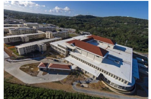
Completed Naval Hospital in Guam