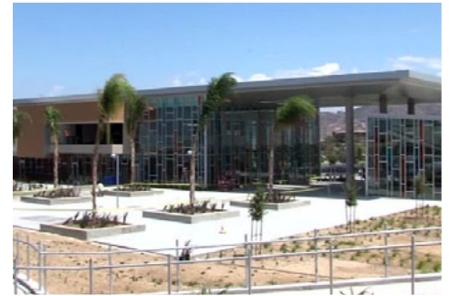
K-8 School, Poway, CA

Skudo's Commercial System, HT (Heavy Traffic) protected concrete from construction materials, stains, machinery and heat, for over a year.