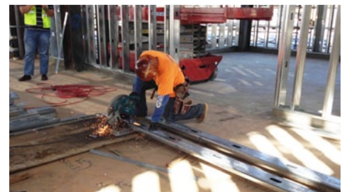
Protection from sparks, heat, machinery, and materials