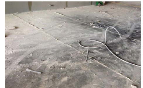
Upholding protection after 12 months down