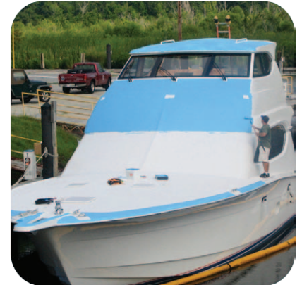
Protects During Storage