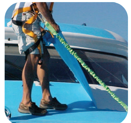
Peel Up Removal