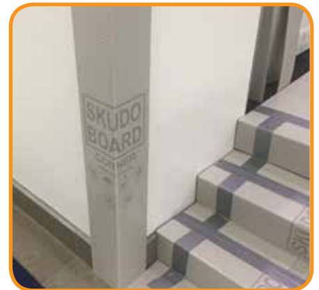
Protects edges and stairs