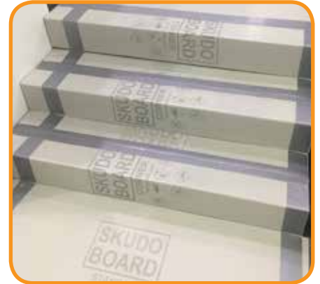
Extremely high impact resistance