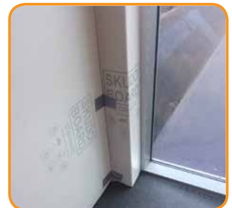
Lightweight, easy to install, reusable

Innovative, purpose-built surface protection systems. This is all we do.