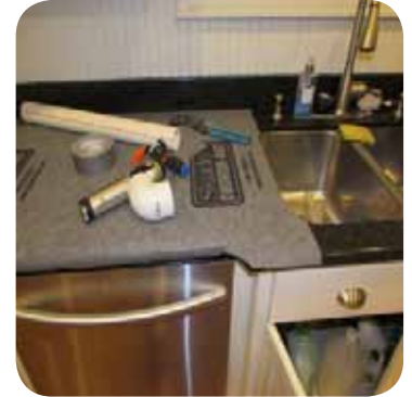
Sized for countertops