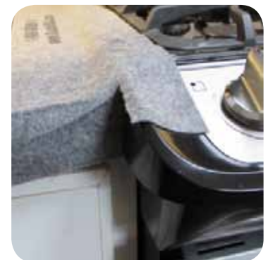
Perfect for small areas