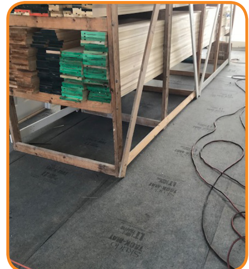
Staging & Storage Areas

*Only use Skudo Tack-Mat on sealed hardwood with a hard wearing factory finished surface (eg : Aluminum Oxide). If in question, please contact Skudo for suitability testing.