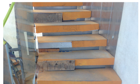
HT Tack-Mat safeguards marble stairs from foot traffic and dirt

Call us for more information and a product sample 1-888-Skudo-11 (1-888-758-3611) www.SkudoUSA.com