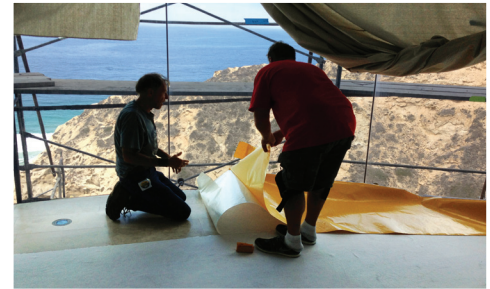
Applying the LT Tack-Mat