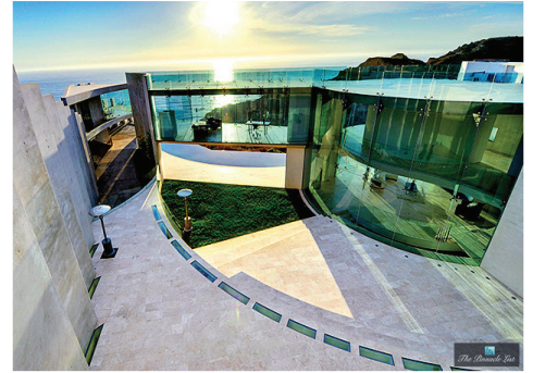
The Razor House, La Jolla, CA

In 2014, Skudo's HT (Heavy Traffic) and LT (Light Traffic) Tack-Mats protected marble and tile while repairs and renovations were underway.