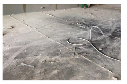
Upholding protection after 12 months down

Skudo's Commercial System, HT (Heavy Traffic) protected concrete from construction materials, stains, machinery and heat, for over a year.