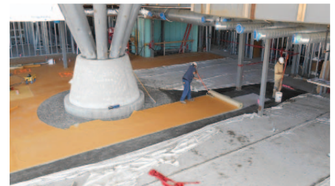
Application of the HT Commercial System