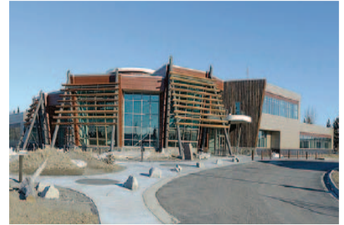
Dena'ina Wellness Center, Kenai, AK