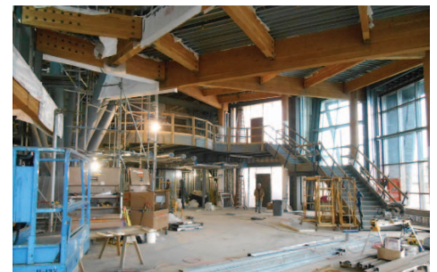
Protection from construction materials and machinery